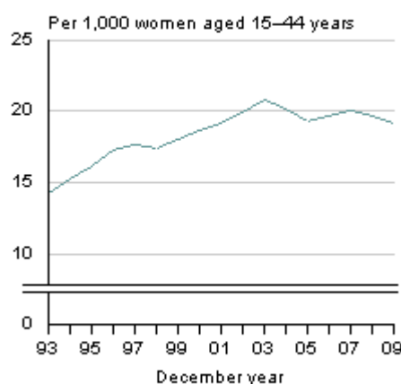
General abortion rate 1993–2009